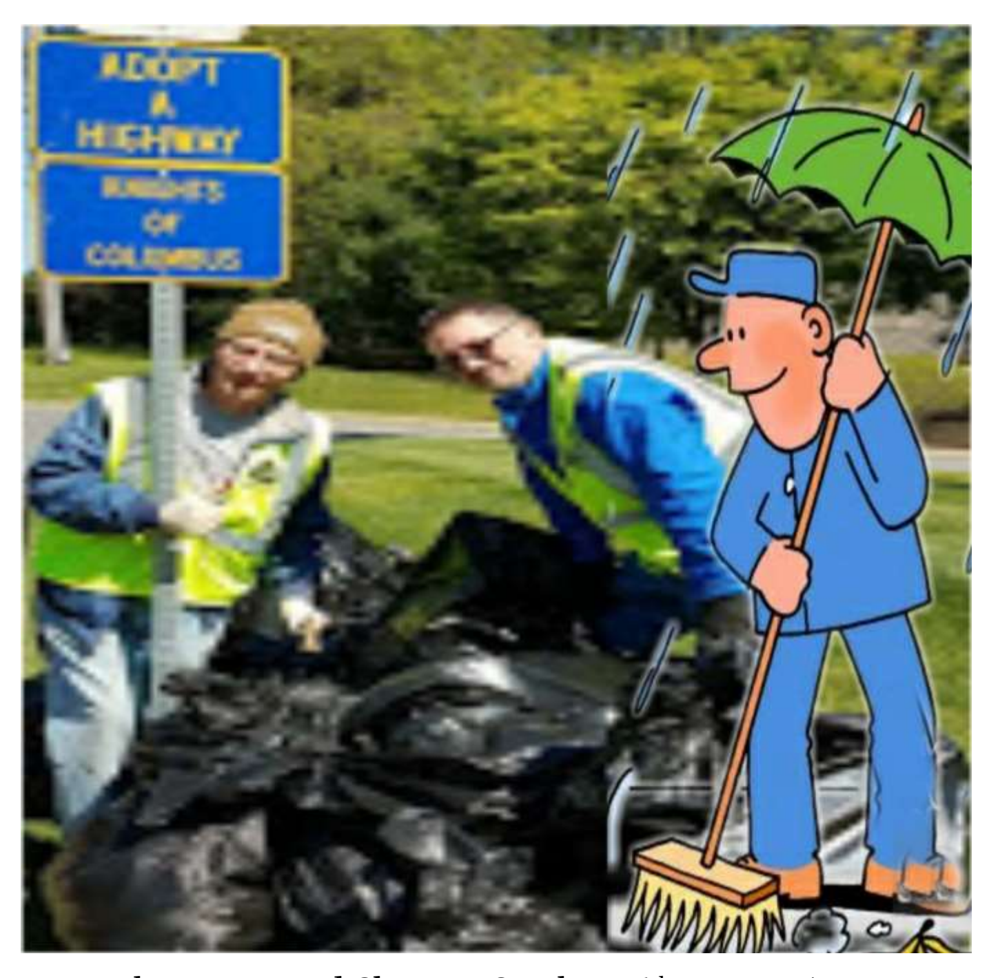
Remember Next Road Clean up October 26<sup>th</sup> 7-10:00 AM